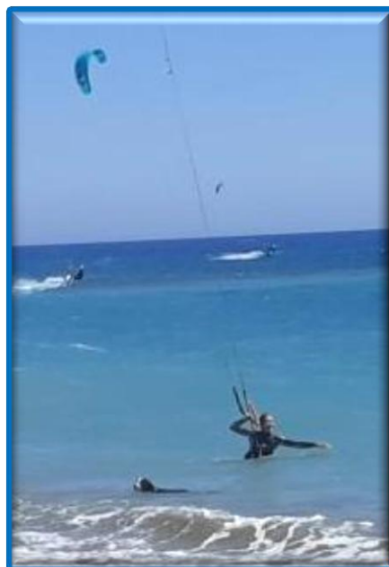
Dog joining in !