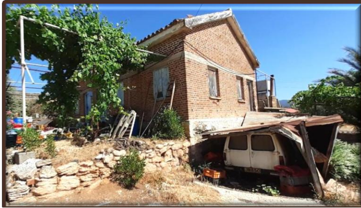
The garage needs some attention!