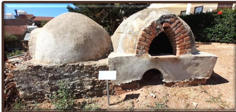
Traditional clay ovens